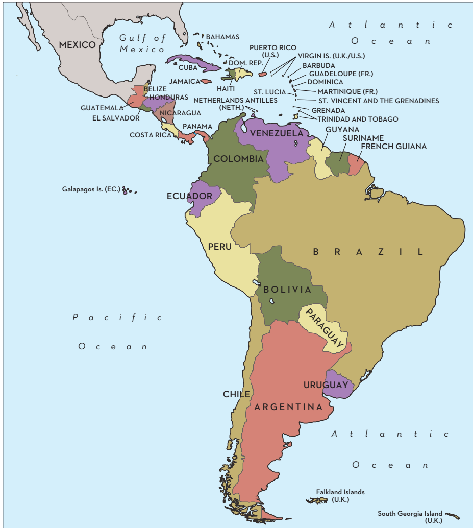
CENTRAL AND SOUTH AMERICA