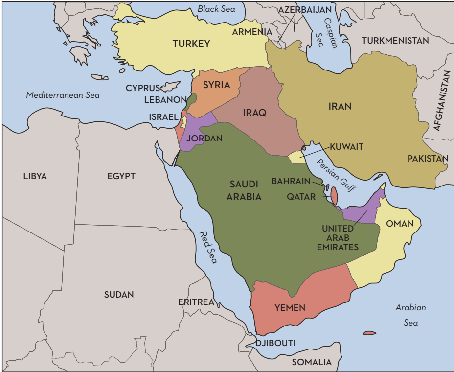
THE MIDDLE EAST